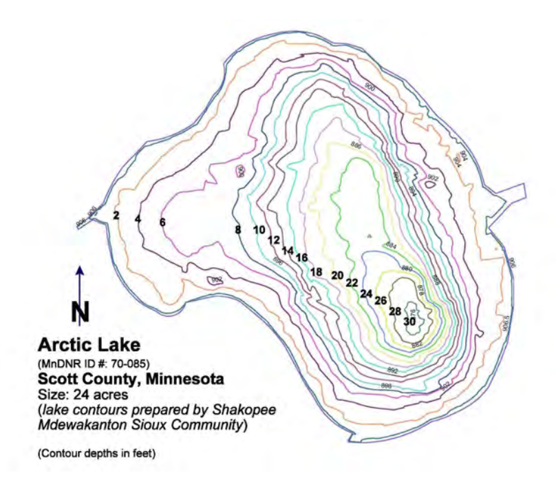
Figure 3. Arctic Lake contour map.