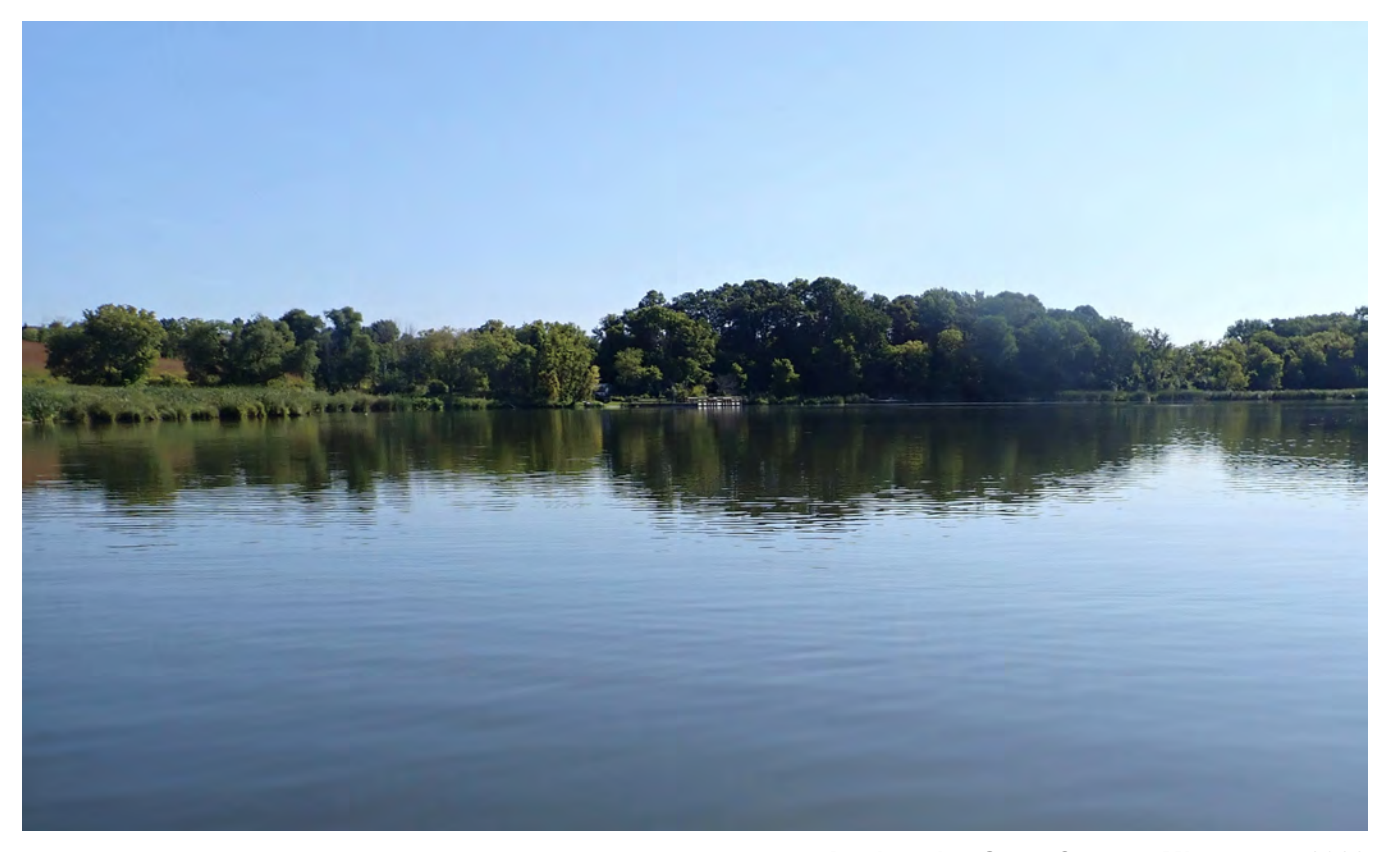
Arctic Lake, Scott County, Minnesota, 2022