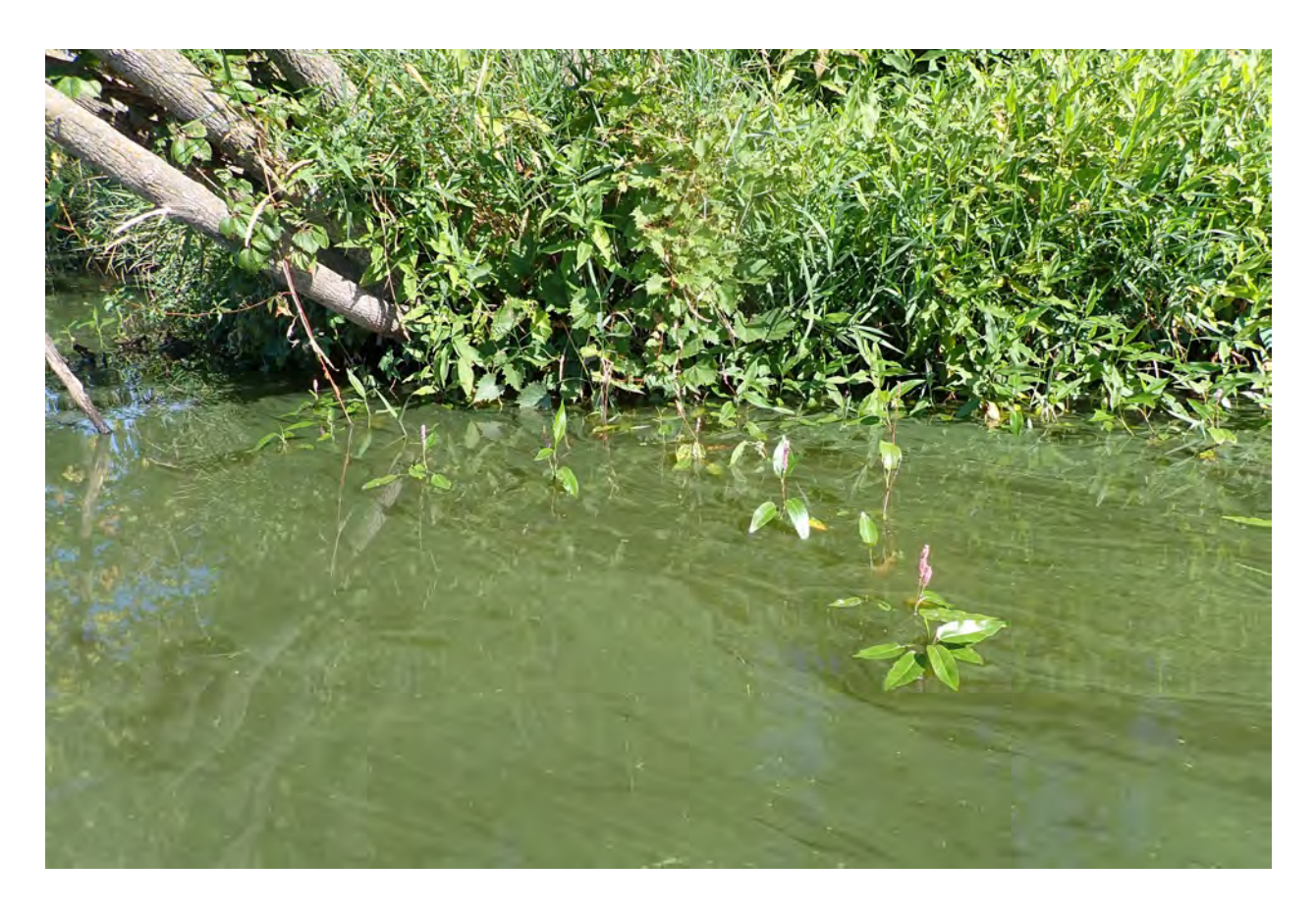
Figure 5. Arctic Lake emergent plant smartweed growing close to shore.