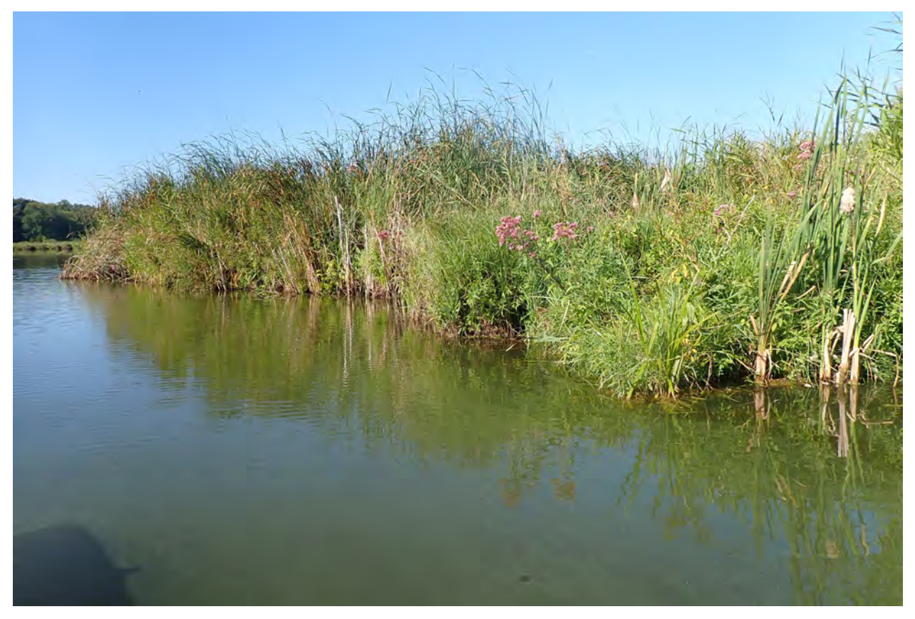
Figure 1. The shoreline of Arctic Lake was mostly undeveloped.

A total of 39 points were surveyed, one aquatic plant was observed at one nearshore site. Aquatic moss was found in four feet of water depth. Arctic Lake shoreline is ringed with native wetland plant species and provides excellent habitat.