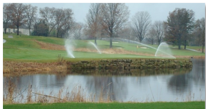
Irrigating With Lake Water