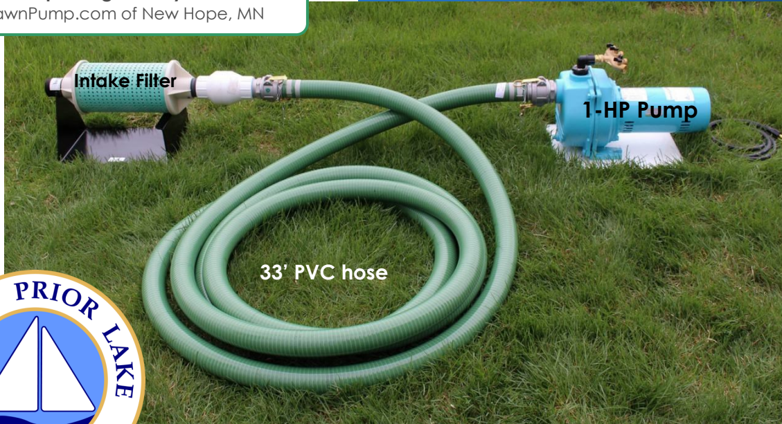
Example Irrigation System Kit LawnPump.com of New Hope, MN

dnr.state.mn.us/permits/water/answers.html#irrigation_non-crop