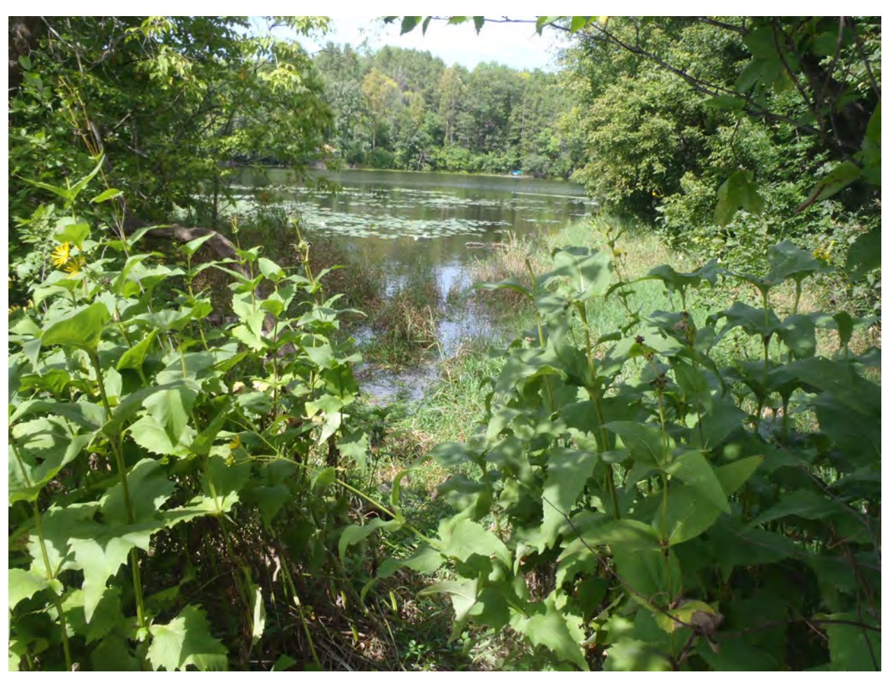
Figure 3. Looking at Cates Lake from the shoreline on August 29, 2016.