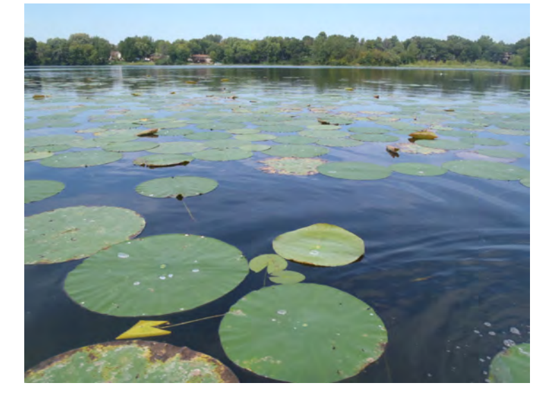
Figure S1. American lotus was found in Cates Lake.