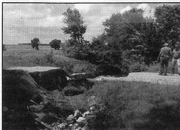
Major damage along the Prior Lake Outlet is being repaired. Some of the damage caused by the 2014 flood can be seen above. Below is a photo of the repair work done at the site.

Representatives to a joint powers agreement (called the "Cooperators," which includes Prior Lake, Shakopee, the Shakopee Mdewakanton Sioux Community, and the District) will review all of the plans and provide feedback on conceptual and preliminary design. It is expected that Barr will finish the final design by