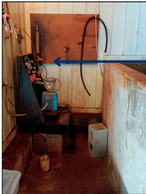
Old pump and skid