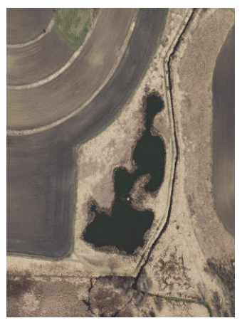
Wetland Restoration, Filter Strips, and Terraces in the Spring Lake watershed

<u>Wetland Restorations</u>: Large volumes of water can also have a negative impact on water quality. Three wetlands have been restored in the watershed that flows to Spring Lake. This reduces downstream flooding by storing water upstream and lowering peak lake levels. The wetlands also filter the water that flows through it which improves the quality of the water.