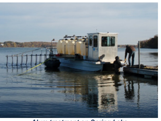
Alum treatment on Spring Lake

Phosphorus can enter the lake from external sources, like streams and ditches. After years of accumulation, phosphorus builds up internally in the sediments on the lake bottom. Phosphorus stored in lake sediments can be difficult to control because, under certain circumstances, phosphorus in the lake sediments can be released back into the lake water.