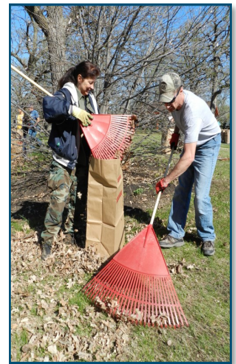
Raking leaves in your yard or at a Clean Water Clean-Up event helps reduce nutrients in lakes