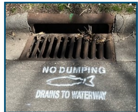
Drain art helps remind citizens not to dump anything into sewer drains