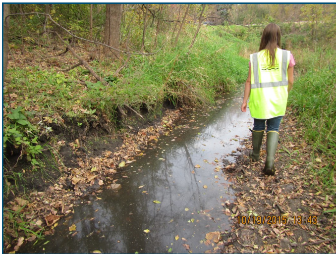
PLSLWD staff monitoring the Prior Lake Outlet Channel