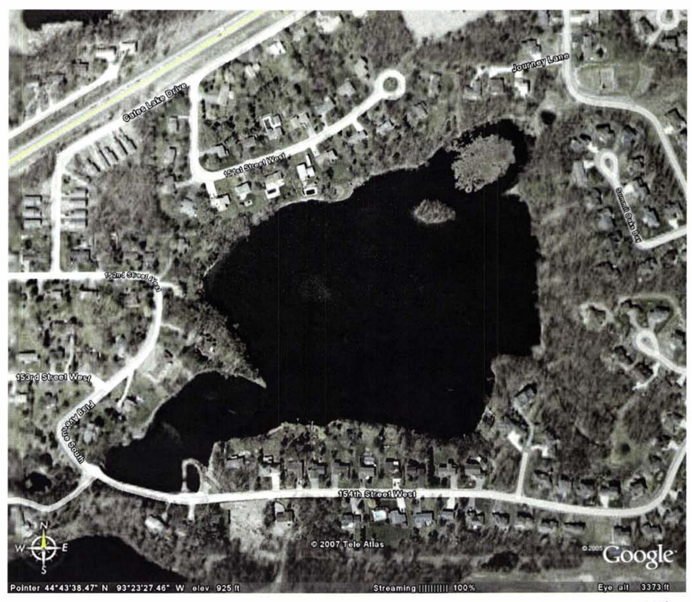
Cate's Lake