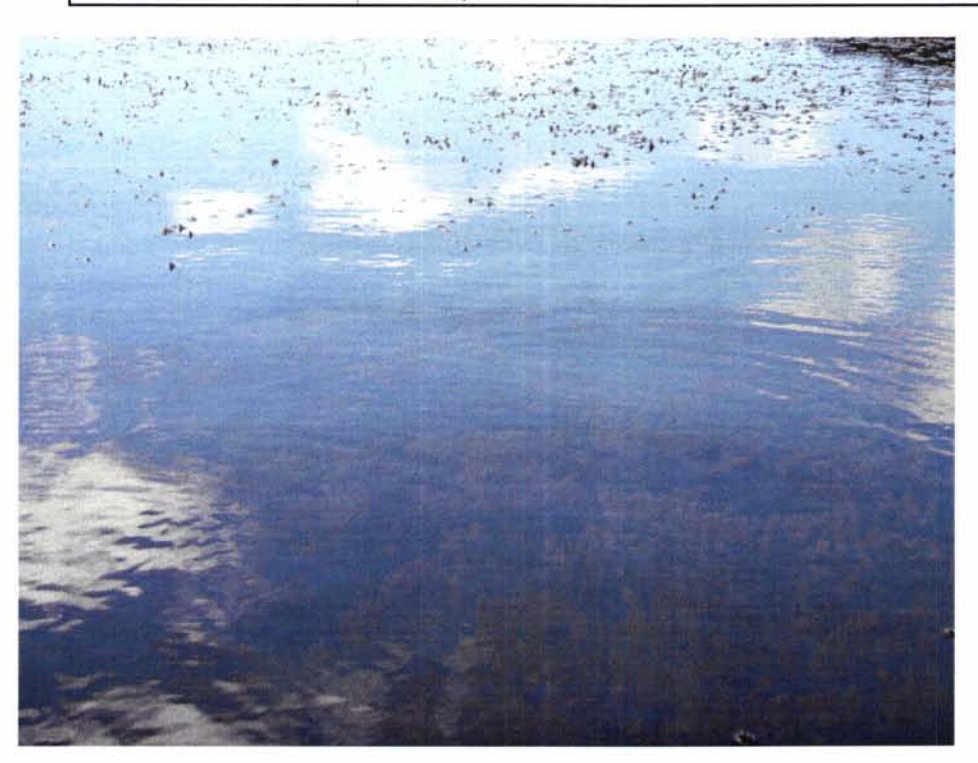
Figure 1. Coontail was the most abundant plant in Cate's Lake and was growing to the surface in shallow water in some areas.