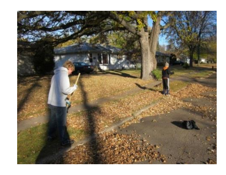
Rake for the Lake Event

In early November, PLSLWD staff organized a Rake for the Lake event. A group of 25 students from the Prior Lake High School EcoTeam