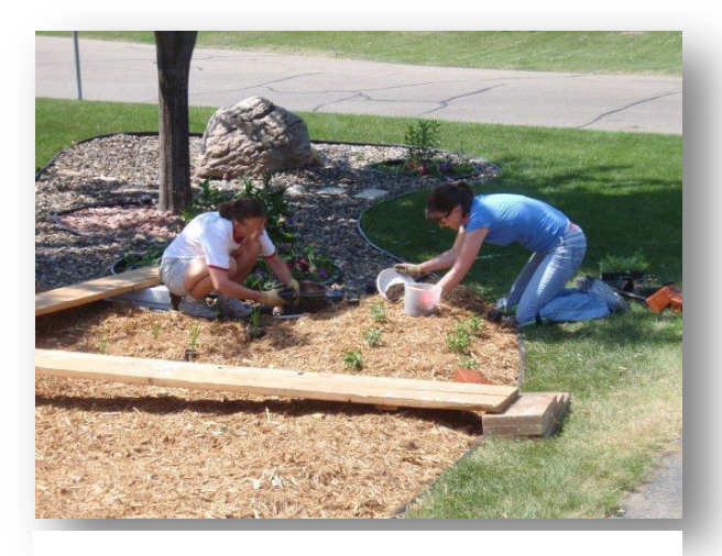
Installing a Rain Garden with the Blue Thumb Program

In 2013, the PLSLWD Board of Managers approved a cost share framework that clarified which types of Best of Management Practices are eligible for incentive. As a result, seven raingardens were installed through the Blue Thumb program, two wells were decommissioned, one landowner participated in a bank-shore stabilization project near Mud Bay on Upper Prior Lake, and one resident installed a rain barrel at their home.