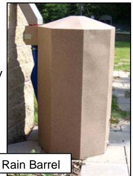
RiverSides Rain Barrel

Website: www.motheearthgarden.com Phone: (612) 724-2296 Address: 3738 42nd Ave. S. Minneapolis, MN 55406